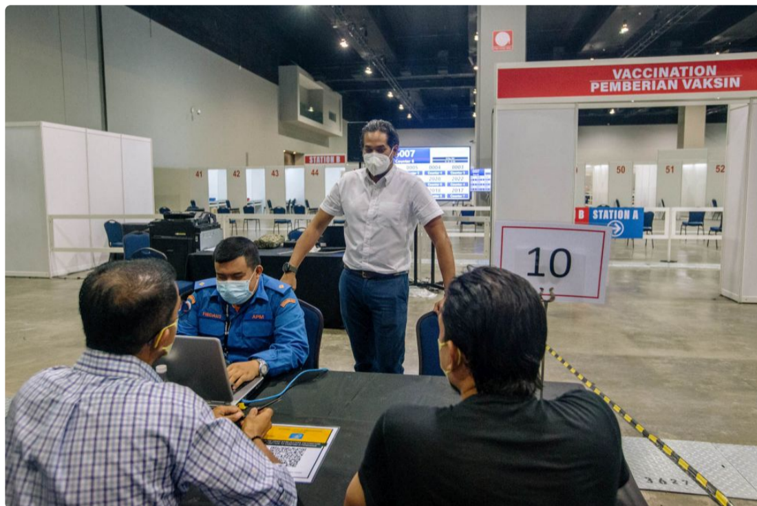
Minister of Science, Technology and Innovation Khairy Jamaluddin during a visit to vaccination centre at the Malaysia International Trade and Exhibition Centre in Kuala Lumpur May 30, 2021.

Subscribe to our Telegram channel for the latest updates on news you need to know.